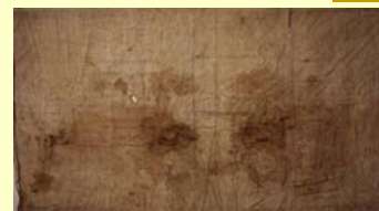
The Holy Sudarium